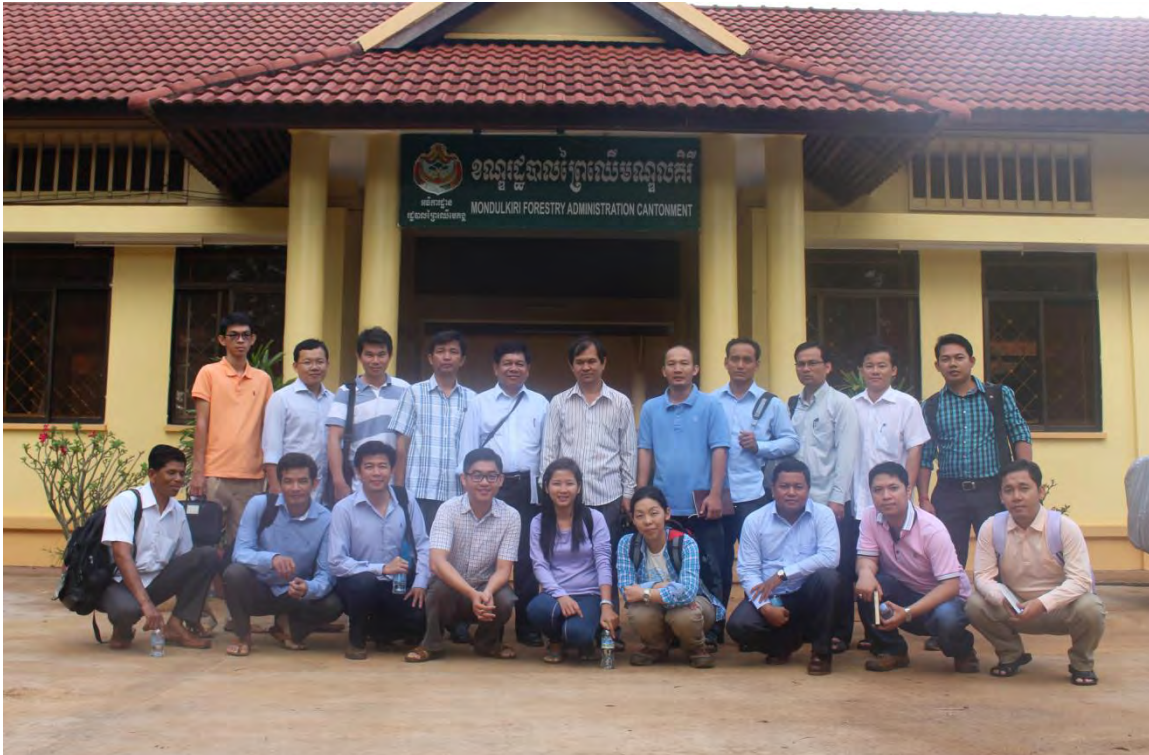
Caption: Group photo in front of Mondulkiri FA Cantonment, Sen Monorom