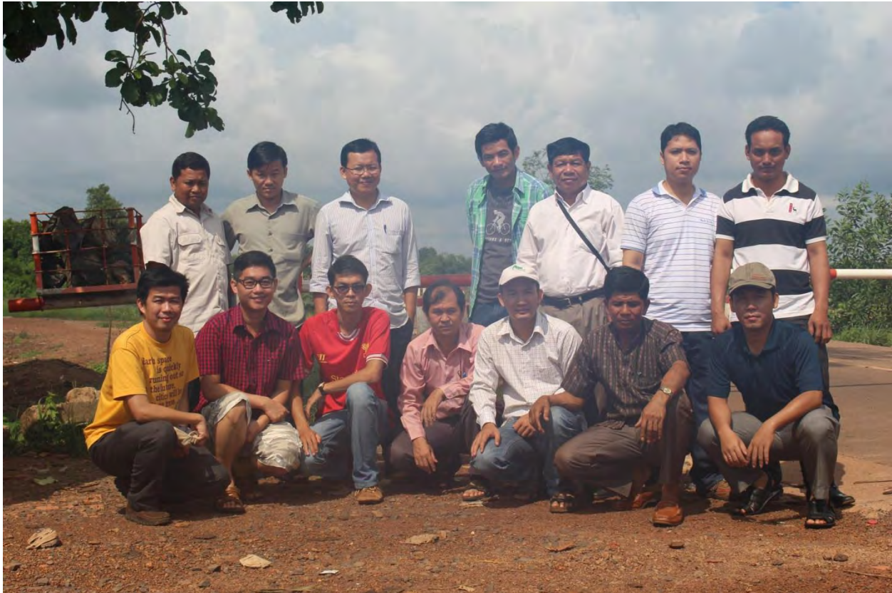
Caption: Group photo at the Cambodia-Vietnam border

We left Sen Monorom to return to Phnom Penh at 8:00 am. Along the way, we stopped by the Cambodia-Vietnam border and Snoul Wildlife Sanctuary. The main purpose of visiting these two stops was to introduce technical team members to the landscape within and around the Seima REDD+ pilot project. The members were given a brief overview of the history of land-use and land-use change at these locations. We safely arrived at Phnom Penh at 2:00pm.