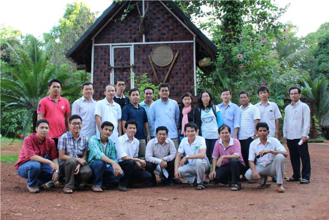
Caption: Social activities for members of the technical teams, at O Ramis