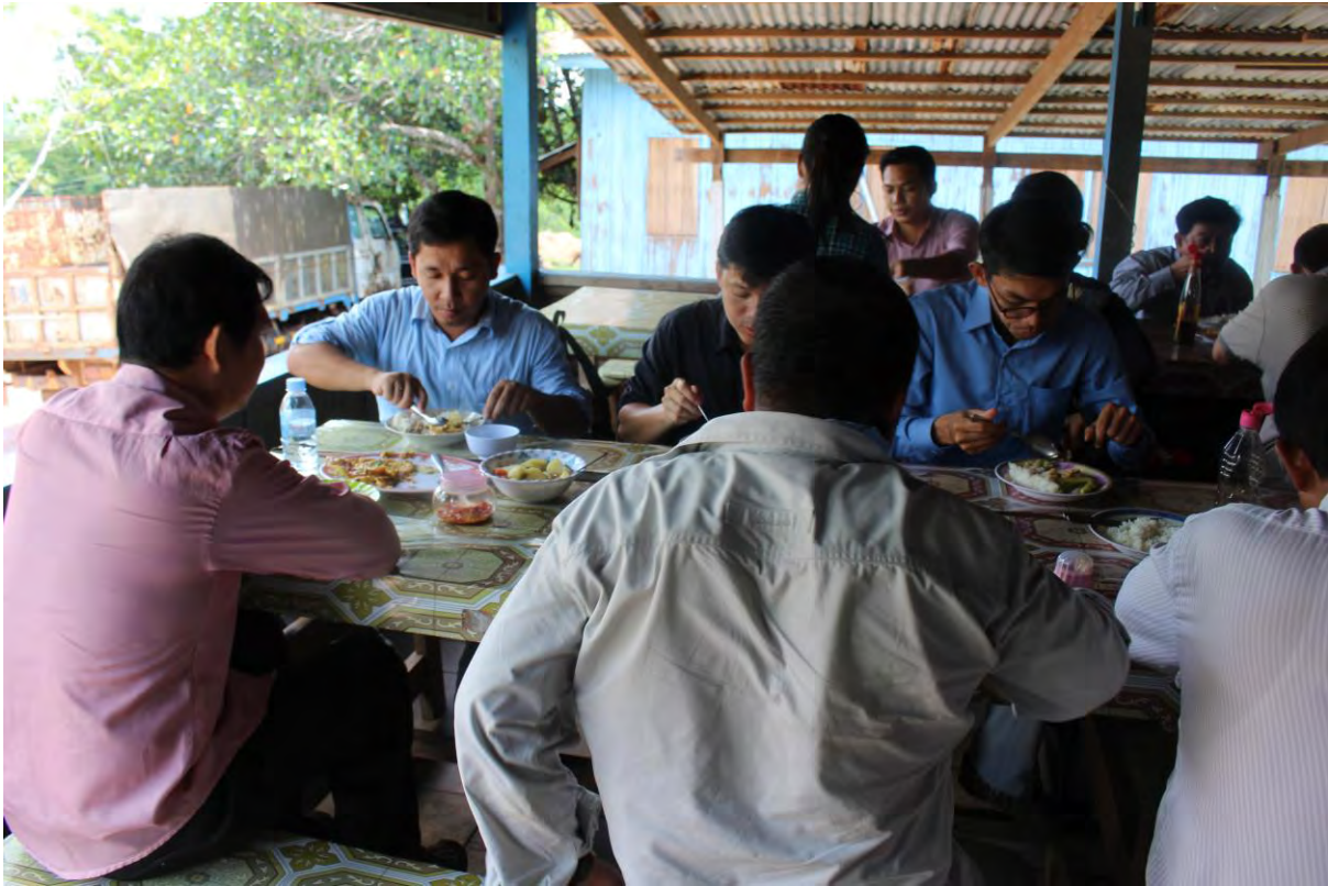
Caption: Lunch at Seima Headquarter