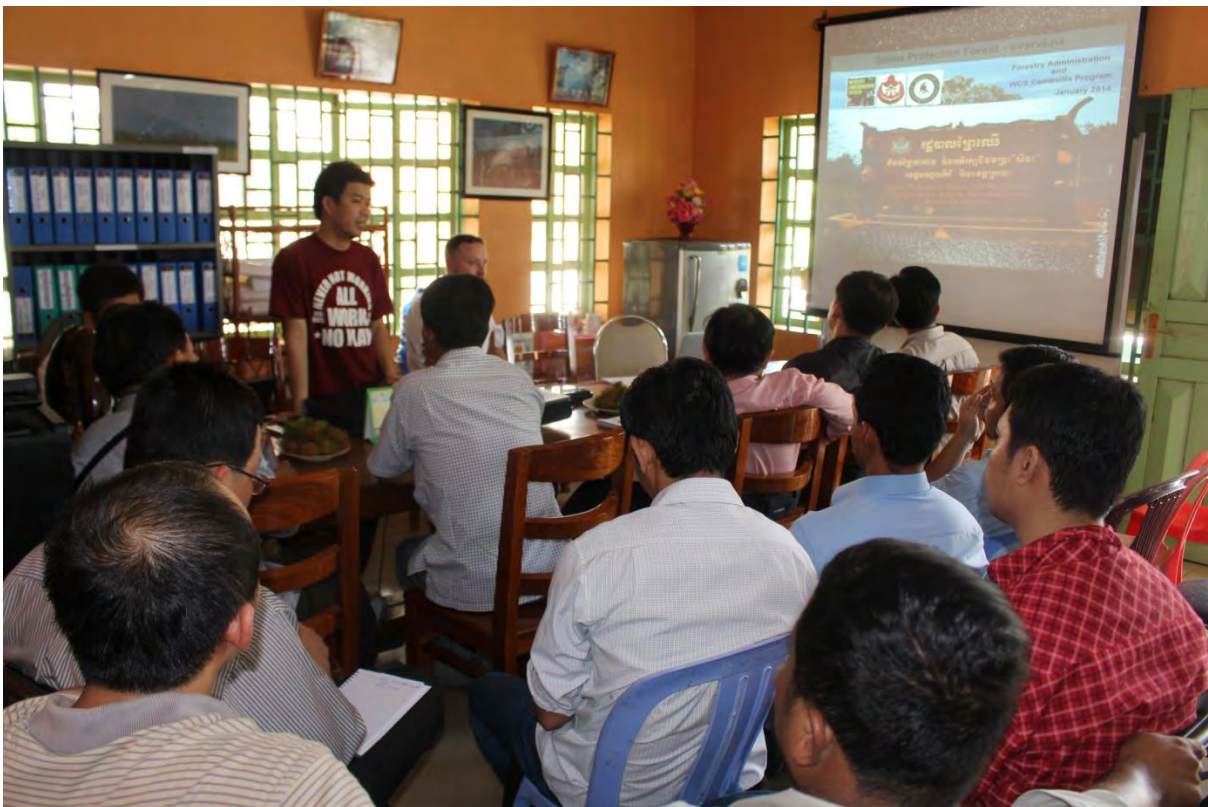
Caption: An overview presentation on the history of Seima Protection Forest