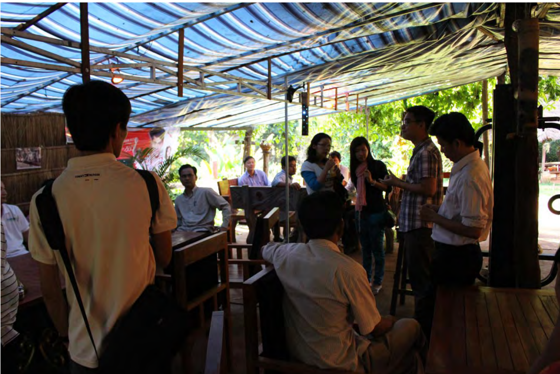
Caption: A brief announcement on the logistics, purposes, etc. of the visit, at O Ramis