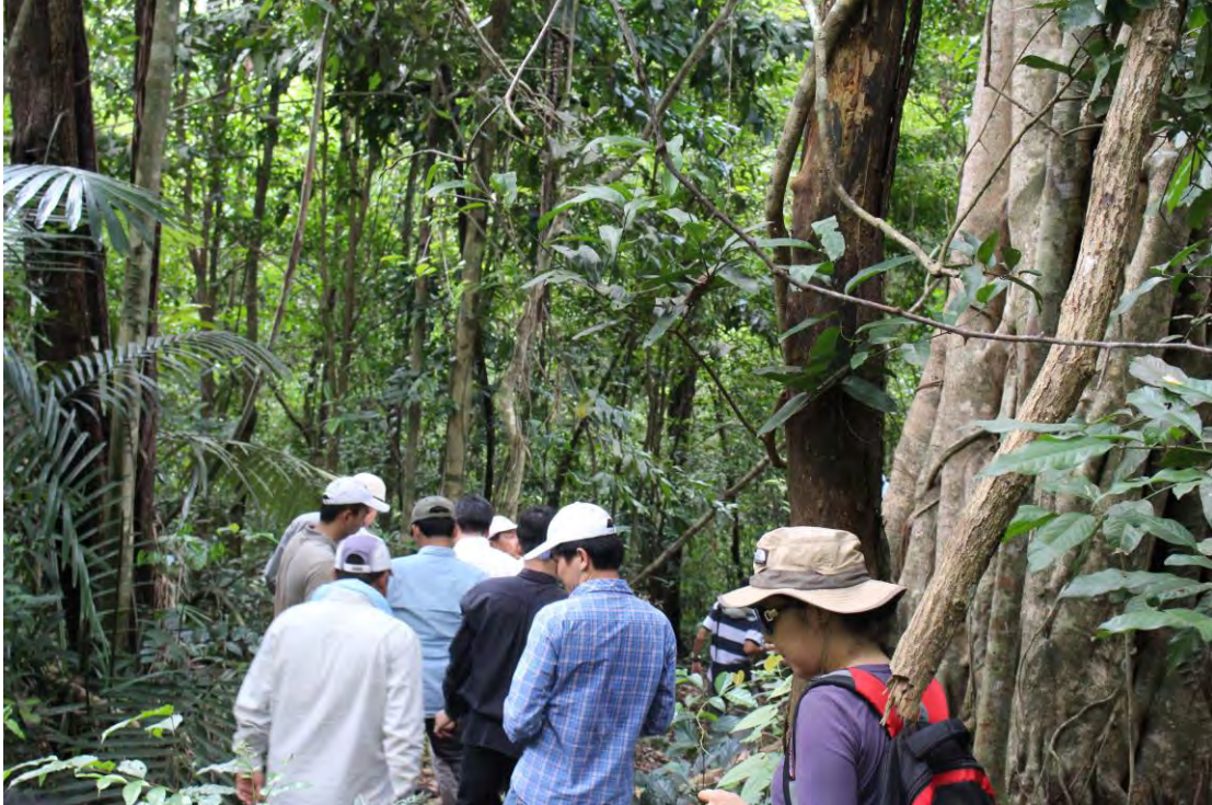
Day 2, Morning: A short walk in Andoung Kraloeung's forest