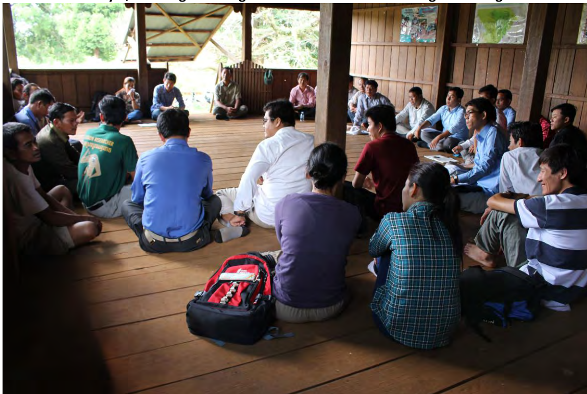
Caption: Discussion with communities on their involvement with REDD+, daily livelihood activities, and other topics related to safeguards and demonstration technical teams