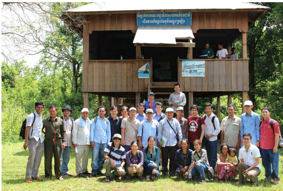
Caption: Group photo in front of community meeting space