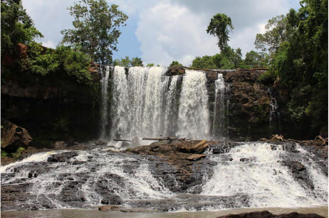
After technical team meetings: Sightseeing at Bou Sra Waterfall