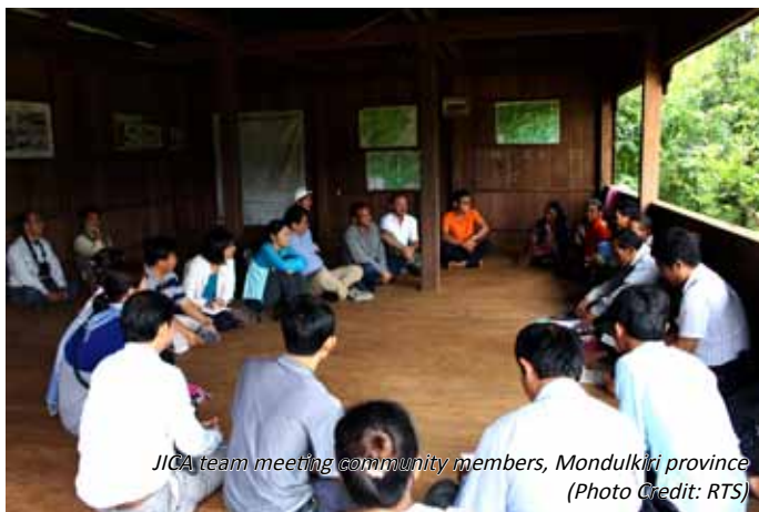
JICA team meeting community members, Monduliri province