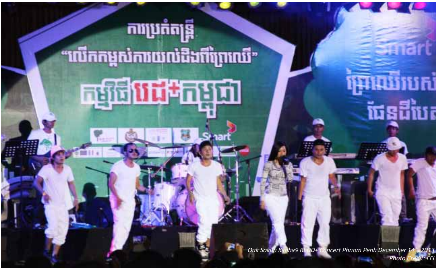
Ouk Sokun Kanha9 REDD+ Concert Phnom Penh December 14 th , 2013