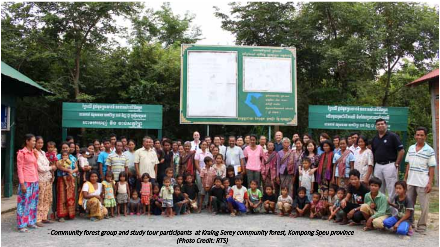
Community forest group and study tour participants at Kraing Serey community forest, Kompong Speu province

From 30 October to 1 November, 2013, three country teams, from Myanmar, Sri Lanka and Vietnam, visited Cambodia to learn about experiences on stakeholder engagement and communications and to exchange information on their own experiences. Other participants came from Nepal, Pakistan and Papua New Guinea.