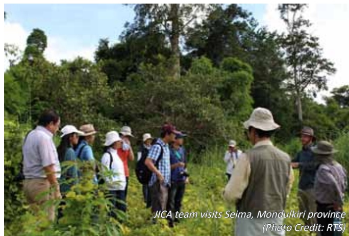
JICA team visits Seima, Monduliri province