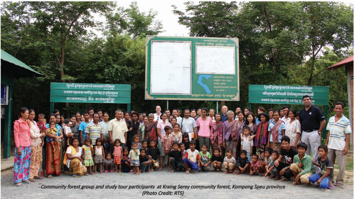
- Community forest group and study tour participants at Kraing Serey community forest, Kompong Speu province

From 30 October to 1 November, 2013, three country teams, from Myanmar, Sri Lanka and Vietnam, visited Cambodia to learn about experiences on stakeholder engagement and communications and to exchange information on their own experiences. Other participants came from Nepal, Pakistan and Papua New Guinea.