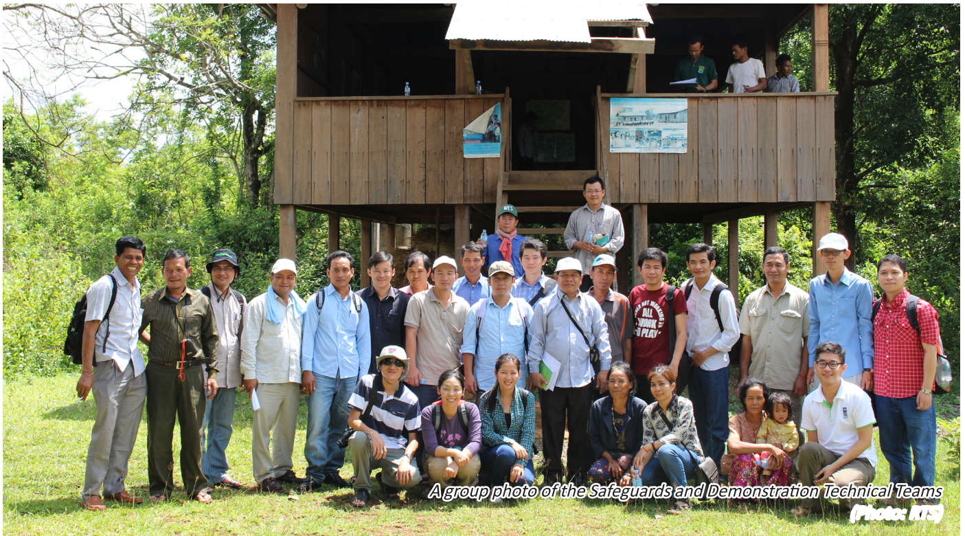
A group photo of the Safeguards and Demonstration Technical Teams