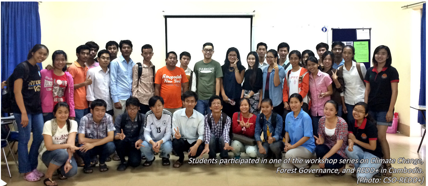
Students participated in one of the workshop series on Climate Change, Forest Governance, and REDD+ in Cambodia.

To contribute to REDD+ awareness raising efforts in Cambodia, the Department of International Studies of the Royal University of Phnom Penh (RUPP) and the Cambodia CSO-REDD+ Network organized ten workshops on REDD+, forest governance and climate change between 15 February and 21 June 2014. Each workshop attracted about 35 students from various departments of the RUPP and the Royal University of Agriculture. The NGO Forum on Cambodia provided financial support.