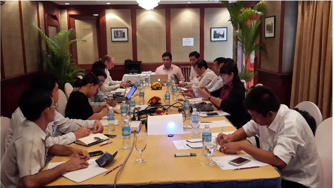
©Figure 1: 13 th MRV Meeting at Imperial Villa Garden Hotel, Phnom Penh, 5 th August, 2014